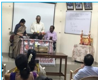
Celebration of W M Day at M. C., Bengaluru