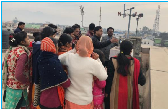
Students visiting at MC, Dehradun

A group of 15 Students of B. A. Third Year (Geography) alongwith 3 faculty member from Shri Haripal Shastri Smarak, Feena, District Bijnor, Uttar Pradesh visited MC, Dehradun on 20 th January, 2019. Students were shown Met-Observatory and briefed about functioning of the observatory.