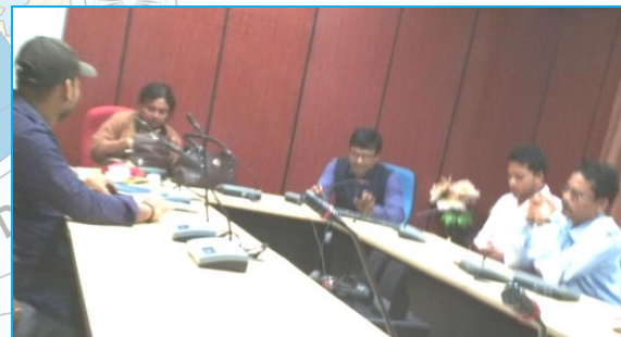
Participants in Meteorological Observations training

Familiarization Training for taking "Meteorological Observations" was conducted at M. C., Bhubaneswar during 11-15 th February, 2019. Six Observers from AMFU Bhubaneswar, G. Udaygiri, Kirei, Chipilima, Mahisapat and Keonjhar in Odisha attended the Training classes.