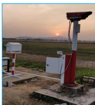
Installation of CWIS system at Gaya

CWIS system has been installed at Gaya, Nagpur and Vijayawada in March, 2019