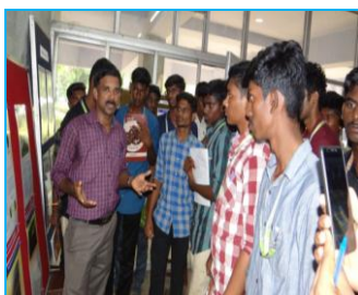
Celebration of W M Day during exhibition and open house at RMC Chennai