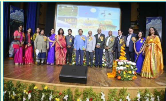
Foundation Day ceremony of IMD