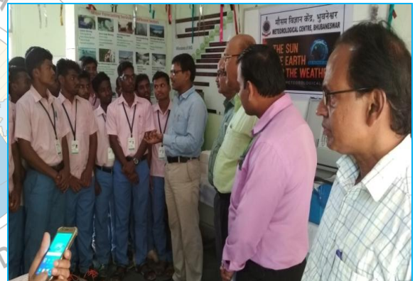
Celebration of W M Day at M. C. Bhubaneswar

An open house Exhibition and Demonstration on Meteorological Instruments and Weather Forecasting Techniques etc. was organized by M. C. Bhubaneswar for the public, especially for the students. More than 150 students with their teachers from local Schools and Colleges, general public & media persons visited the Exhibition on the WMO day.