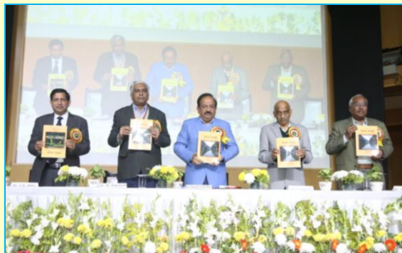
Releasing of IMD's Hindi magazine मौसम-मंजूषा

A documentary film titled "Early warning Services of IMD" showcasing achievements of IMD during 2014-18 was telecasted during the Foundation Day ceremony of IMD on 15 th January, 2019.