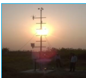
Installation of CWIS system at Nagpur and Vijayawada