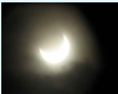
26 th January 2009 ,Partial Solar Eclipse

An annular eclipse of Sun occurred on 26 th January 2009. The phenomenon of this partial solar eclipse was visible from southern part of India, eastern coast, Andaman & Nicobar Islands and Lakshadweep.