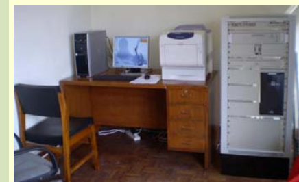
DMDD receiving system at Kathmandu