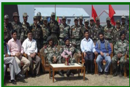
Army Personnel at Srinagar

A two week's Met Observer's Training course to 58 army personnel's under project PARWAT has been imparted jointly by instructors from MC Srinagar and SASE at Mountain Met Centre, (SASE) Srinagar from 7-18 Sep 2009.