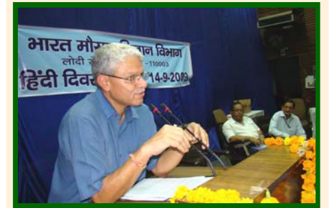
महानिदेशक द्वारा अध्यक्षीय भाषण