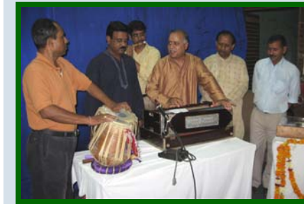
विभाग के कार्मिकों द्वारा प्रस्तुत संगीत कार्यक्रम

इसमे विभाग के कार्मिकों ने शिक्षाप्रद झलकियाँ, हास्य झलकियाँ, नृत्य, गीत एवं संगीत का रंगारंग कार्यक्रम प्रस्तुत किया।