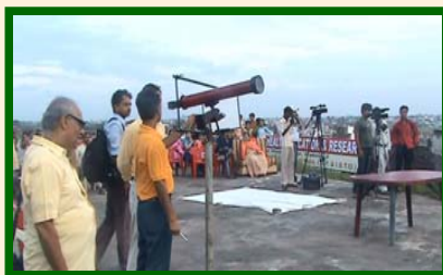
Total Solar Eclipse Observation on 22 nd July at Patna

A team comprising of seven officials from Positional Astronomy Centre, led by Shri S. Sen, Director, went to Patna for conducting scientific experiments on Total Solar Eclipse of 22 nd July, 2009. A number of enthusiastic visitors and dignitaries were present at the observation site to watch the longest duration total solar eclipse of the century.