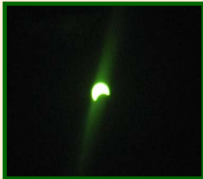
Solar Eclipse at Delhi, 22 nd July, 2009