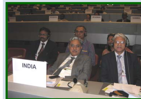
Indian Delegation at WMO, Geneva