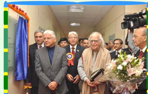
Hon'ble Minister inaugurating C-Band Polarimetric Radar

IMD has procured two C-band Doppler Weather Radars. The first C-band Doppler radar was installed and inaugurated in Delhi by Shri Ashwani Kumar, Minister of State of Science & Technology and Earth Sciences, on the occasion of IMD's 137 th foundation day on 15 th January 2012. This C-band Doppler radar goes a step above the S-band Doppler weather radar and gives additional information. It can identify the type of precipitation-whether it's rain, hail or snow. It can also determine the intensity of winds. This will be useful in detecting storms over the Delhi area. It would imply a real time engagement with the dissemination system directly reaching out to the citizens and user groups. Severe weather warning over very specific locations is the target of nowcasting.