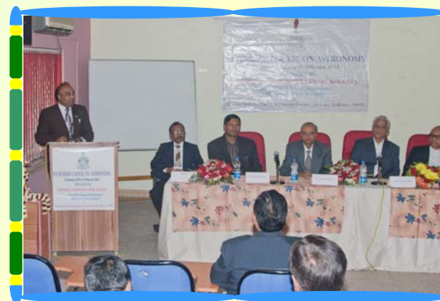
Refresher course on Astronomy at PAC, Kolkata