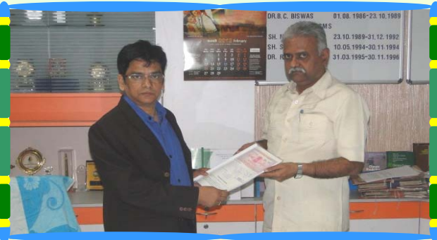
MoU between IMD-AFCL