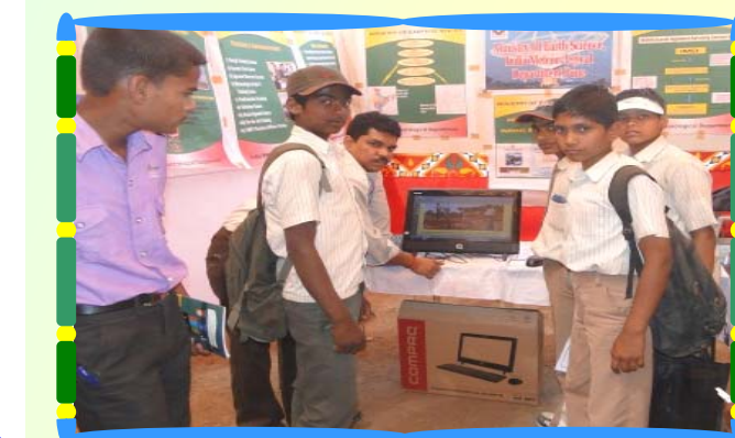
Exhibitions on agricultural weather service