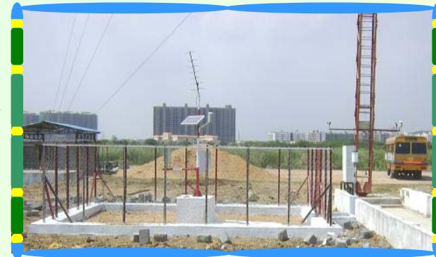
Automatic Rain Gauge at Sathyabama University