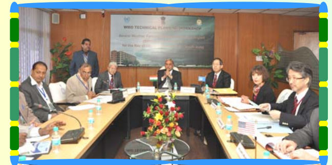
WMO workshop inaugurated by the Secretary, MoES