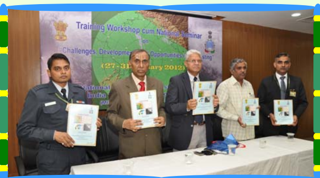
Release of Guide book on Nowcast

The three day Training Workshop on "Challenges, Developments and Opportunities in Nowcasting" (CDO-NOW-2012) was organized by National Weather Forecasting Centre, New Delhi from 27-29 Jan, 2012 to give a thrust for development and implementation of a 24 x 7 Monitoring and Nowcasting system for high impact weather events in IMD. The structure of Training Workshop was designed to focus on the application of Observations, Synoptic, DWR, NWP, Satellite techniques in Nowcasting. Lectures were given on various themes by the experts/reowned scientists from IMD, NCMRWF, Indian Air force, Indian Navy, SAC Ahmedabad, IIT Delhi, IITM, Pune, SHAR and Coast Guard. The workshop was attended by about 50 participants from various Institutes/Departments across the country.