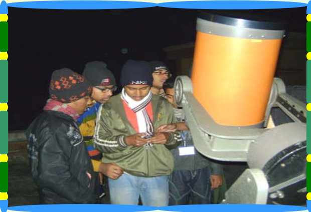
Trainees at PAC Kolkata during course on Astronomy