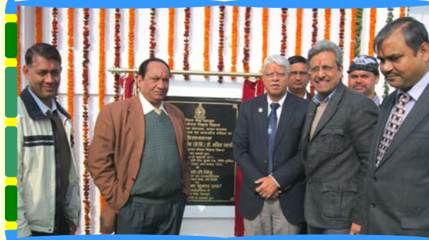
Foundation Stone ceremony at Dehradun