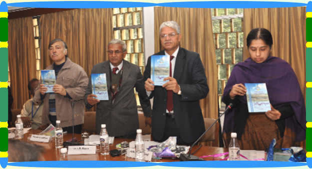
Release of "Climate of Ahmedabad"