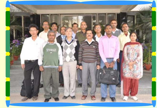
Group photo of Trainees along with IMD officials

The annual training of two weeks duration for Cyclone forecasters from WMO/ESCAP panel countries along with the forecasters from Area Cyclone Warning centre/Cyclone Warning Centre of India Meteorological Department was organised during 20 th February to 02 nd March 2012. The Cyclone forecasters one each from countries, viz., Srilanka, Maldives and Thailand participated in this training programme.