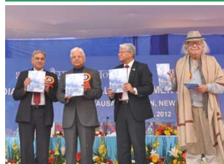
मौसम सेवाओं की उपयोगिता का विमोचन