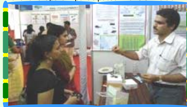
M. C. Thiruvananthapuram stall at SURAKSHAAYANAM

Surakshaayanam – 2012 an international workshop & exhibition on "Disaster Risk Reduction and Contingency Planning" was organized by Kerala State Disaster Management Authority during 4 th to 10 th March 2012. It was inaugurated by Shri Oommen Chandy, Hon'ble Chief Minister of Kerala, at Kanakakkunnu Palace grounds, Thiruvananthapuram. Officers from M. C. Thiruvananthapuram participated in this exhibition.