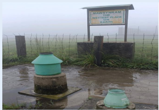
New AWS was propose for World's Rainiest place at Mawsynram

New AWS was propose for World's Rainiest place at Mawsynram. The project was approved by Head, RMC Guwahati with site selection completed on 4<sup>th</sup> August, 2023 and NOC received from DDMA East Khasi Hills.