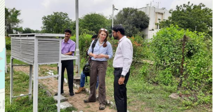
A team of delegates from National Institute of Malaria Research (ICMR)

A team of delegates from National Institute of Malaria Research (ICMR) and a group of trainees (State Officials) from Gujarat Institute of Disaster Management (GIDM)visited the Met Centre, Ahmedabad on date: 29<sup>th</sup> August, 2023.