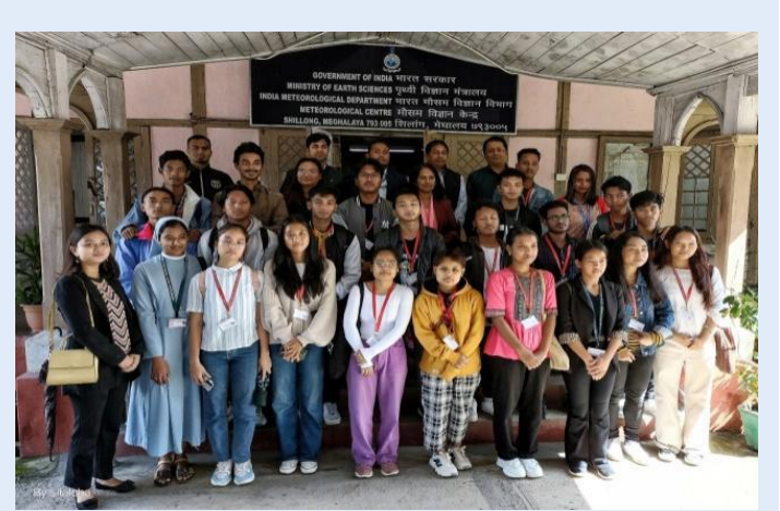
Student & Teacher of UCC Barapani College visited at MC Shillong

22 Students and 4 Teachers , Dept. of Physics, UCC Barapani College visit at MC Shillong on 22<sup>nd</sup> September, 2023.