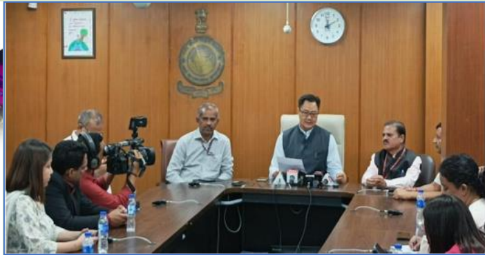
Hon'ble Minister of Earth Sciences Shri Kiran Rijiju addressing the Press

IMD Nowcast & Weather Forecast during G20 Event