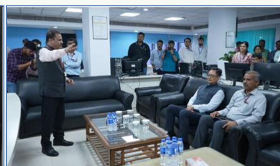
DG, IMD explaining about activities including indigenous decision support system for weather forecasting of IMD to Hon'ble Minister

During the G20 event held at Bharat Mandapam, IMD ensured timely provision of Weather Services and distributed weather updates across a range of platforms, including Twitter, Facebook, and WhatsApp. The weather information were made also available through a dedicated webpage (https://mausam.imd.gov.in/g20), this encompassed the delivery of both real-time nowcasts and detailed weather forecasts for the Bharat Mandapam area during the event.