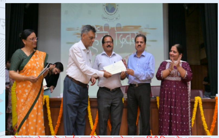
प्रोत्साहन योजना के अंतर्गत महानिदेशक महोदय द्वारा हिंदी दिवस के अवसर पर मुख्यालय में कार्यरत कार्मिकों को प्रमाण-पत्र प्रदान किए गए

वर्ष 2022-2023 के लिए सरकारी कामकाज मूल रूप से हिंदी में करने की प्रोत्साहन योजना के अंतर्गत महानिदेशक महोदय द्वारा हिंदी दिवस के अवसर पर मुख्यालय में कार्यरत 06 कार्मिकों को प्रमाण-पत्र प्रदान किए गए।