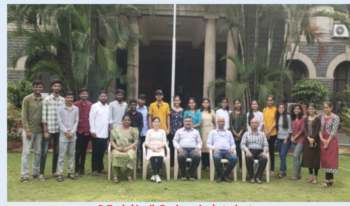
B.Tech (Agril. Engineering) students

Four-weeks summer placement course organized by Agrimet Division, IMD, Pune for B.Tech (Agril. Engineering) students during 4-28 September, 2023.