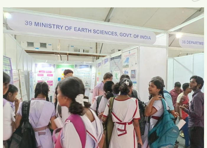
Student and other visitors visiting MoES Stall during 26<sup>th</sup> National Science Exhibition from 24 -27 August, 2023

On behalf of MoES, the officers and staff members of RMC Kolkata participated in "26<sup>th</sup> National Science Exhibition on the theme of 'Contribution to make advances, powerful and great India" from 24-27 August, 2023 at Central Park Maidan, Kolkata organized by Central Calcutta Science and Culture Organisation for Youth, 'Ananda Bhaban'. Various meteorological instruments, charts, MoES flexes were displayed, briefed about meteorological observation and its importance for weather forecasting.