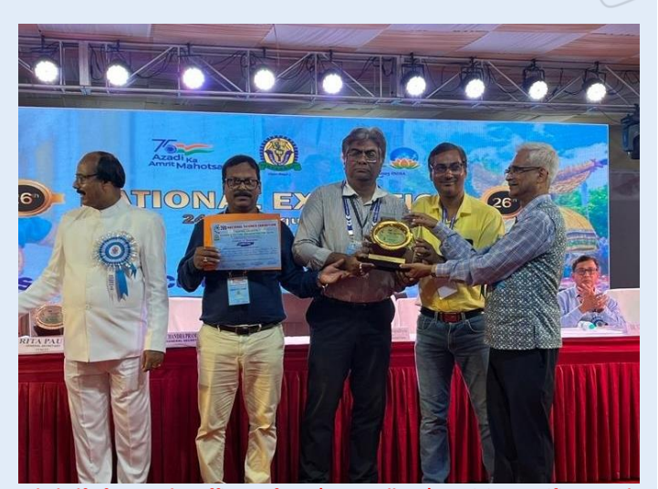
On behalf of MoES the Officers of IMD(RMC Kolkata) receiving certificate and a memento for participation in 26<sup>th</sup> National Science Exhibition