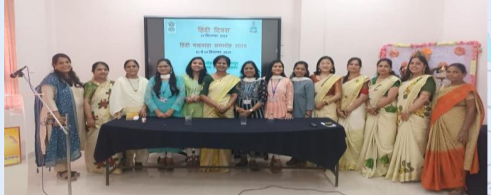
Hindi Pakhwada Celebration (RMC Nagpur) 1-14, September, 2023