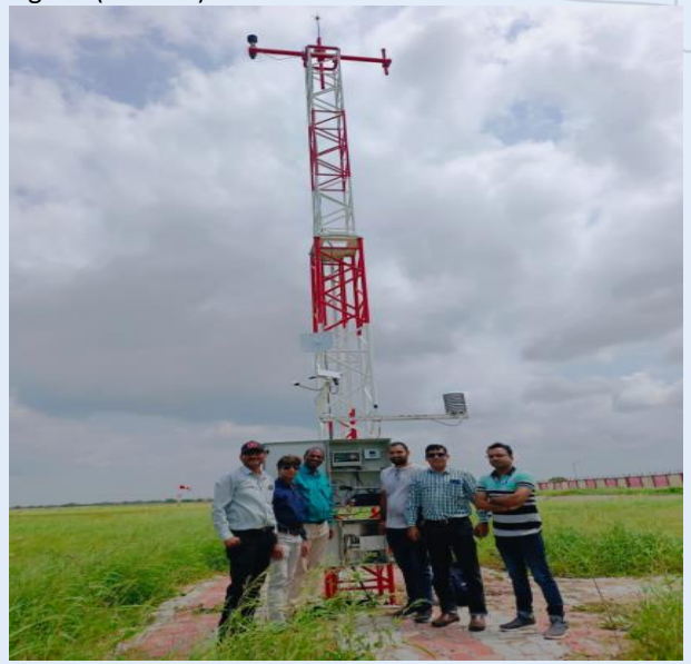
PWD at Vadodara

September : Coochbehar (RWY 22); Vadodara (RWY 22); Jharsuguda (RWY 24)