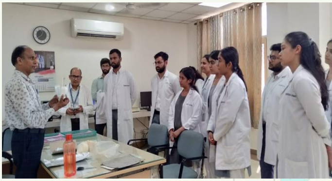
Students of various colleges visited MC Dehradun

Officials of NERLDC visited RMC Guwahati office for a meeting dated 12<sup>th</sup> September, 2023 related to installation of AWS/ARG in various stations in NE- Region.